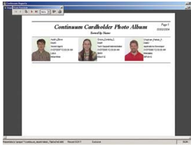
Three-Column Page Format Sorted By Name

After configuring your photo album pages, click the "Photo Album" button to review your album pages before printing.