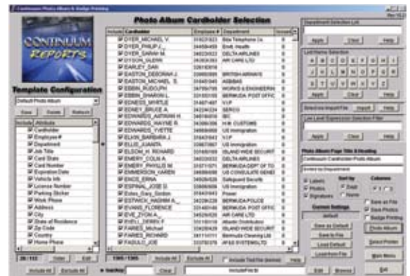
Photo Album Configuration Screen

Photo Album's “point-and-click” configuration screen makes creating a photo album quick and easy . Select the cardholders you want to display in the album using Photo Album's powerful, built-in search engine. Select by last name, by department, and/or select using filter criteria such as Visitors, Disabled Cards, Expired Cards, etc.