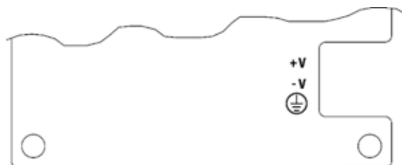
Optional DC Power Layout